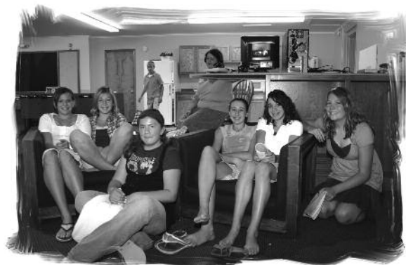
Confirmation students enjoy TableTalk.