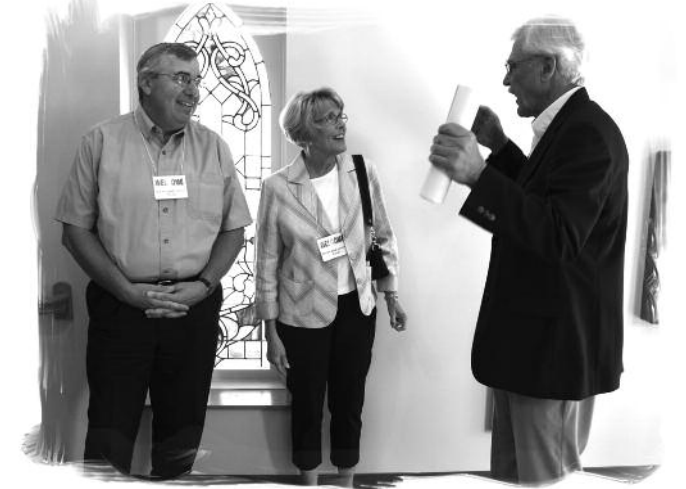
Warm friendly greeters meeting you.