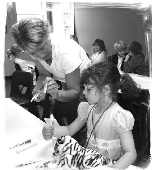
Special moments happen in Sunday school.