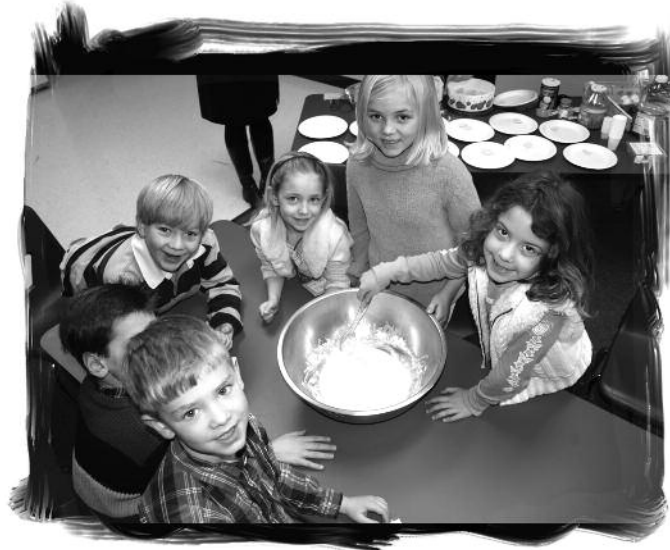
Children making unleavened bread for Passover Feast.

Any monies received above $1,000,000 will be allocated equally between debt reduction and sanctuary renovations.