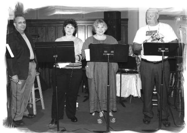
Hearts on Fire Praise Team.

This Capital Campaign is about Sharing Christ’s Love . This campaign will allow us to strengthen our financial position and to care for our sanctuary. You are invited to claim your church’s legacy as we launch the next 150 years of Sharing Christ’s Love .