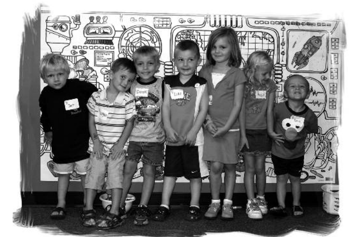
4 year olds enjoying VBS in new Fellowship Room.