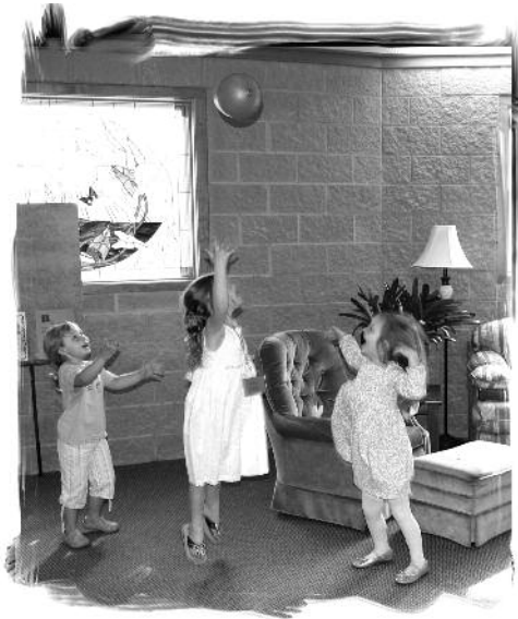
Jumping for joy for Jesus!

“LET THIS BE WRITTEN FOR A FUTURE GENERATION, THAT A PEOPLE NOT YET CREATED MAY PRAISE THE LORD.”