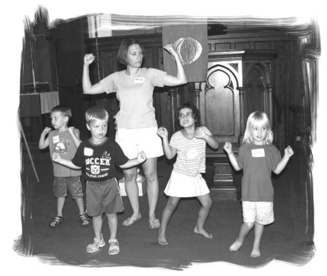
Strong and courageous children of God.

In 2006, First Lutheran Church celebrated its 150th anniversary. Those 150 years have been deeply rooted in the ministry of Jesus Christ to Geneseo and beyond. Indeed, we have much to celebrate.