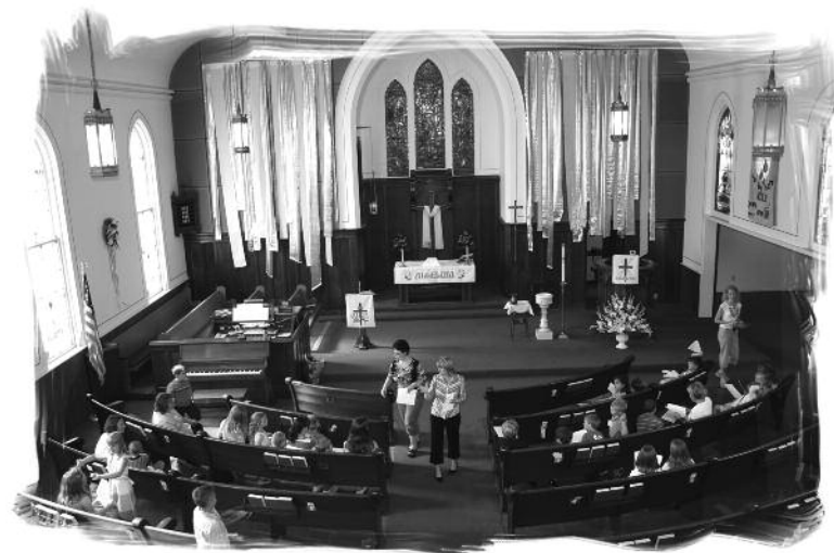
Gathering together to sing.

“JESUS CHRIST IS THE SAME YESTERDAY AND TODAY AND FOREVER.”