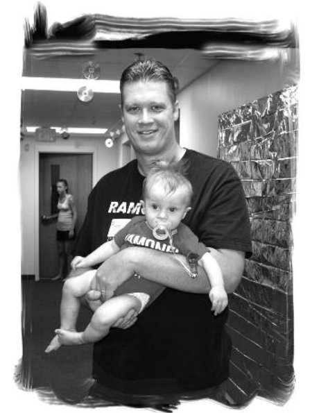
Volunteers come in all ages.