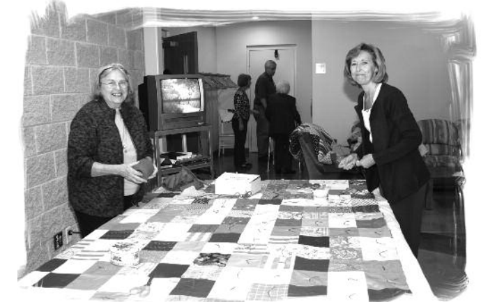
Cover Girls quilting.