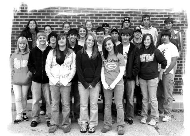
Senior high youth go camping.