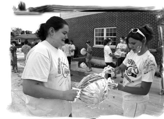
Confirmation students enjoy Fear Factor fun at First.