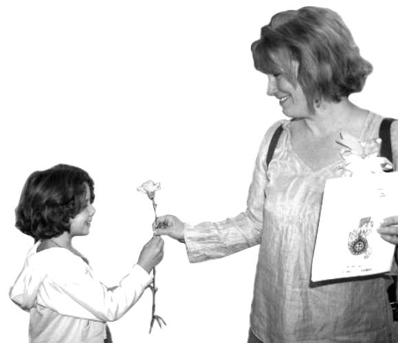
A sign of love.

This new Capital Campaign is a way for us to celebrate our growth at First Lutheran Church. This campaign will allow us to address our debt and to renovate our sanctuary. Please join us as we begin this new Capital Campaign, “Celebrating First: Sharing Christ’s Love.”